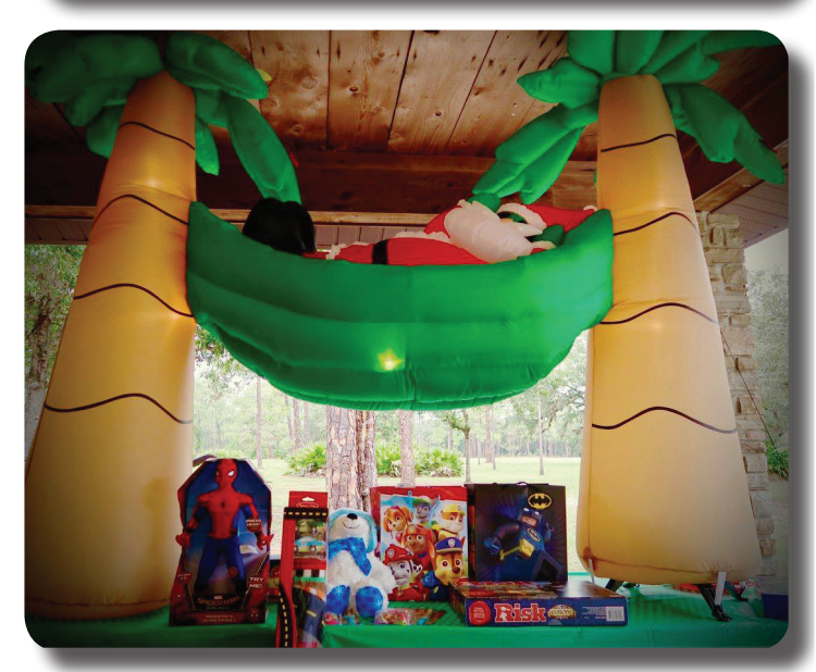
Above, MCO PFK members met for a "Christmas in July" gift drive to collect toys for the upcoming visits to area hospitals. A great time was had by all and lots of great gifts are awaiting December deliveries.