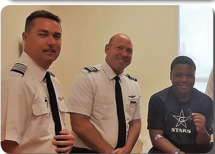
Above and above, right, volunteers in ATL made two midyear visits to patients at Hughes Spalding Children's Hospital. A great time was had by all!