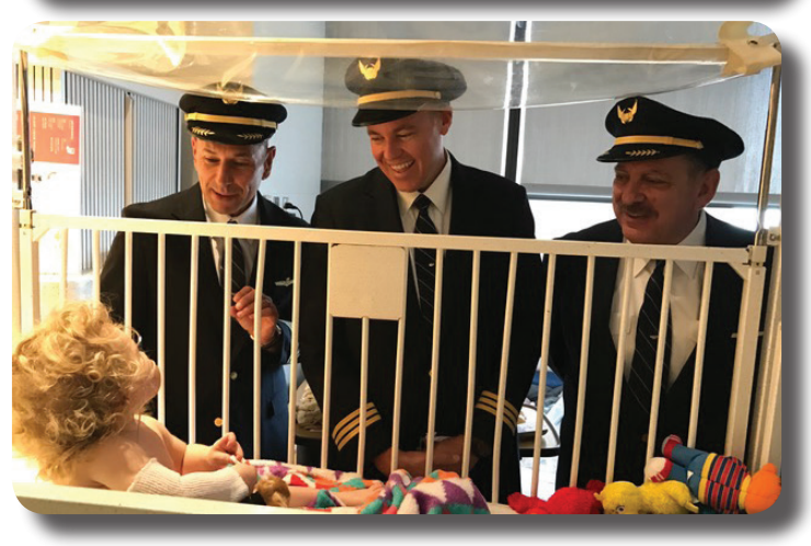
Above, HOU PFK volunteers visited with approximately 120 youngsters at Texas Children's Hospital during their mid-year visit on June 13th.