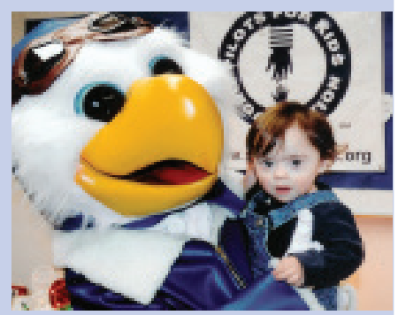
PFK Mascot, Capt.Baldy SM

The Pilots For Kids logo is a registered trademark. The name "Pilots For Kids" and the Pilots For Kids mascot character are protected trademarks and/or servicemarks (SM) of the Pilots For Kids, Inc.