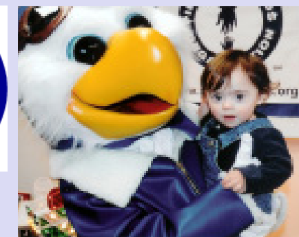
PFK Mascot, Capt. Baldy SM

The Pilots For Kids logo is a registered trademark. The name "Pilots For Kids" and the Pilots For Kids mascot character are protected trademarks and/or servicemarks (SM) of the Pilots For Kids, Inc.