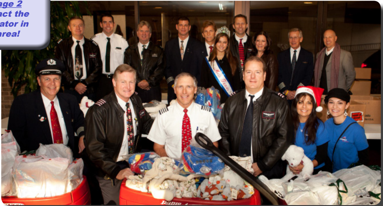
PFK volunteers in Dallas/Fort Worth prepare to deliver an array of gifts to hospitalized children during one of five hospital visits in the DFW area in December, 2010.