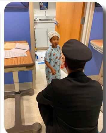
Above, PFK volunteers at SAV distributed a wonderful selection of gifts to youngsters on Dec. 17th.