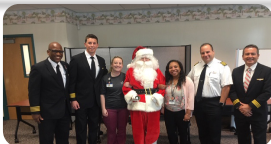
Right, young patients in Fort Myers enjoyed the PFK visits. Santa was even able to take time from his busy schedule!