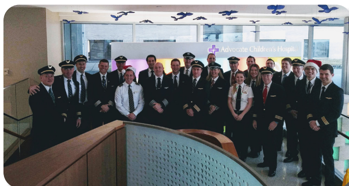
Above and right, a dedicated group of PFK volunteers from the Chicago area visited patients and distributed gifts at Lutheran’s Children’s Hospital.

On December 9th, PFK volunteers from the Chicago area gathered to hand out gifts to children at Lutheran’s Children’s Hospital.