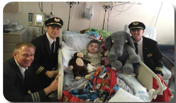
Above, PFK volunteers at RDU visited WakeMed Children’s Hospital to spread holiday cheer for the 10th year.