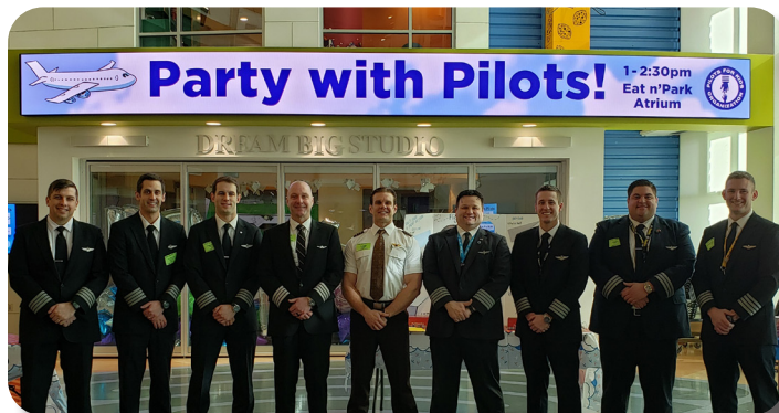
Above, PIT volunteers held their “Party with Pilots” event at UPMC Children’s Hospital, delivering loads of toys to hospitalized patients.

PFK volunteers from Pittsburgh had their yearly “Party with Pilots” gathering at UPMC Children’s Hospital. The visit was another great success! Thirty-six feet of tables were required to hold all of the toys. The children and volunteers all had a wonderful time!