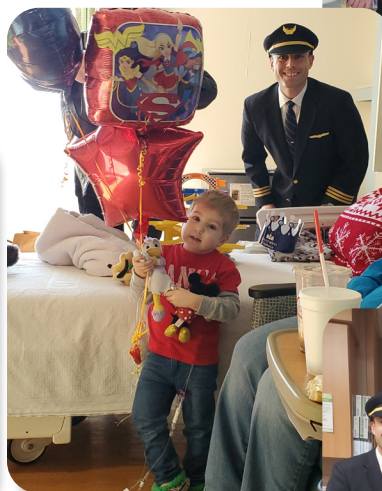
Above and right, PFK members distributed gifts to patients at Sanford and Avera McKennan Children’s Hospital during the holiday season.