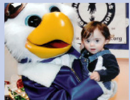
PFK Mascot, Capt. Baldy SM

The Pilots For Kids logo is a registered trademark. The name "Pilots For Kids" and the Pilots For Kids mascot character are protected trademarks and/or servicemarks (SM) of the Pilots For Kids, Inc.