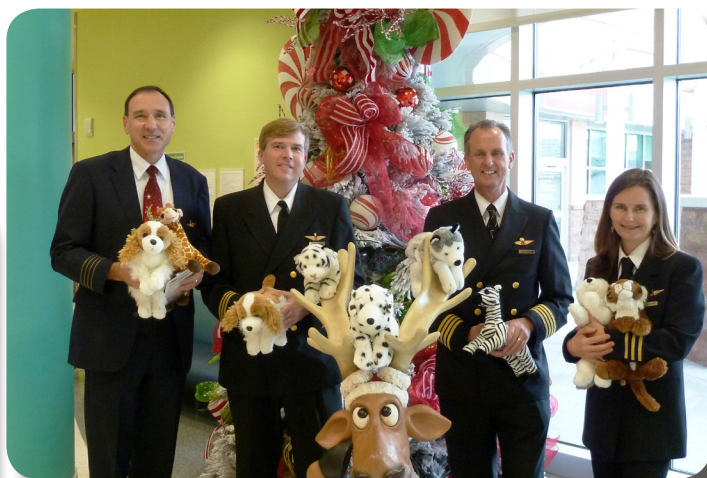
Above, a happy group of PFK volunteers prepare for their annual holiday visit to Hughes Spalding Children’s Hospital in Atlanta.

Pilots for Kids has enjoyed an excellent relationship with the Hughes Spalding staff for a number of years, and the group anticipates additional visits in January and February.