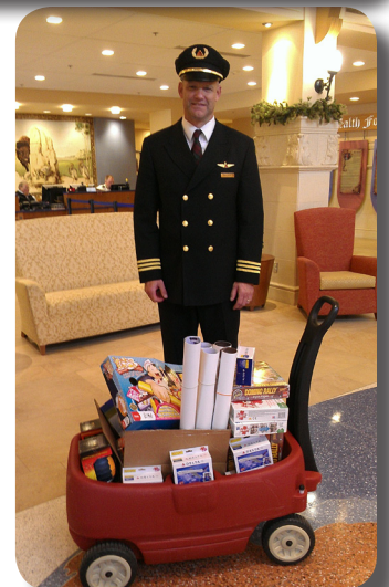
Right, Delta PFK members spread holiday cheer as they visited hospitalized Children at the Sanford Children’s Hospital is FSD.