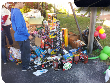
Above and right, a happy group of youngsters received gifts and a welcomed visit from PFK volunteers at Our Dominican Sisters in Hialeah, FL