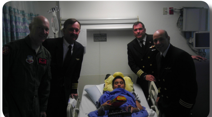
Above, LAS members spread cheer as they visited children at UMC’s Children’s Hospital.