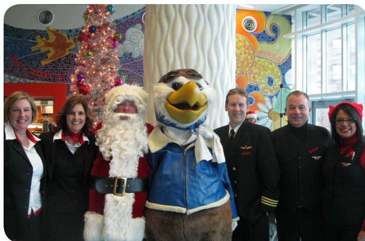
Below and right, GRR volunteers gathered to spread good cheer and holiday gifts to over 200 children at DeVos Children's Hospital and Gilda's Club. Activities included a pizza luncheon, holiday dinner, crafts, cookie decorating and visits with Santa. A great time was had by all!!!