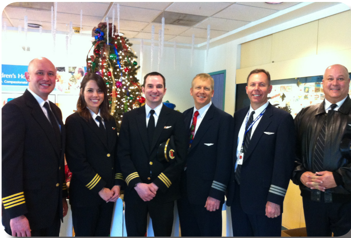
Above, PFK volunteers from ORD visited young patients at Advocate Christ Children’s Hospital.

December 13th was a special day at Advocate Christ Children’s Hospital in Chicago, as this was the day that an enthusiastic group of PFK volunteers delivered toys and holiday cheer to hospitalized children at that facility. The smiling faces of the pilot group (below) is indicative of the wonderful time everyone had.