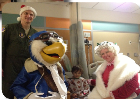
Above, volunteers from Pt. Pleasant, NJ didn't let the effects of Hurricane Sandy slow them down as they visited children at the Jersey Shore Medical Center.