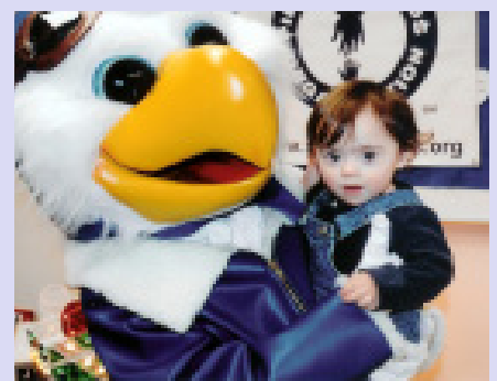
PFK Mascot, Capt. Baldy SM

The Pilots For Kids logo is a registered trademark. The name "Pilots For Kids" and the Pilots For Kids mascot character are protected trademarks and/or servicemarks (SM) of the Pilots For Kids, Inc.