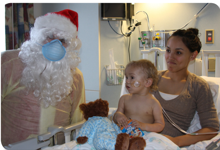
Above, “Santa” donned sterile garb to visit this young patient in ANC during the PFK holiday visits.

The ANC PFK group had another very successful year with hospital visits. Over 20 uniformed Fed Ex pilots, spouses, family members and “Santa” got together on December 18th for visits to two local hospitals, Providence and Alaska Native. In addition, a smaller group gathered to deliver gifts to Mat-Su Regional Medical Center. The group also delivered wrapped gifts to the local Clare House emergency homeless shelter for women and children. These dedicated volunteers distributed over 200 wrapped gifts, parent gift bags, candy canes, chocolates and loads of Christmas cheer throughout their visits. They were also joined by one of the FedEx pilots and his singing quartet who entertained throughout the day. The response from those visited was heartwarming and the group agreed that it was another very successful event.