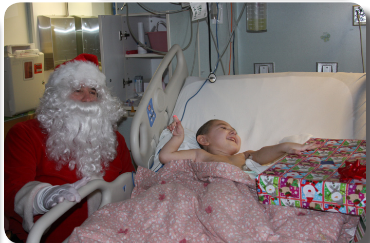
Above, ANC PFK volunteers brightened the day for many children during their 2012 holiday visits to 3 hospitals and a homeless shelter.