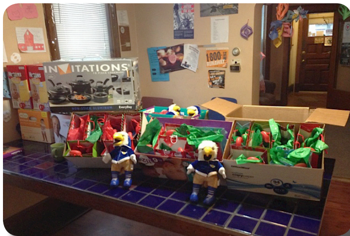
Above, gifts are ready for distribution at two MKE area events. Although the pilot group was unable to attend due to weather, the events went on as planned.