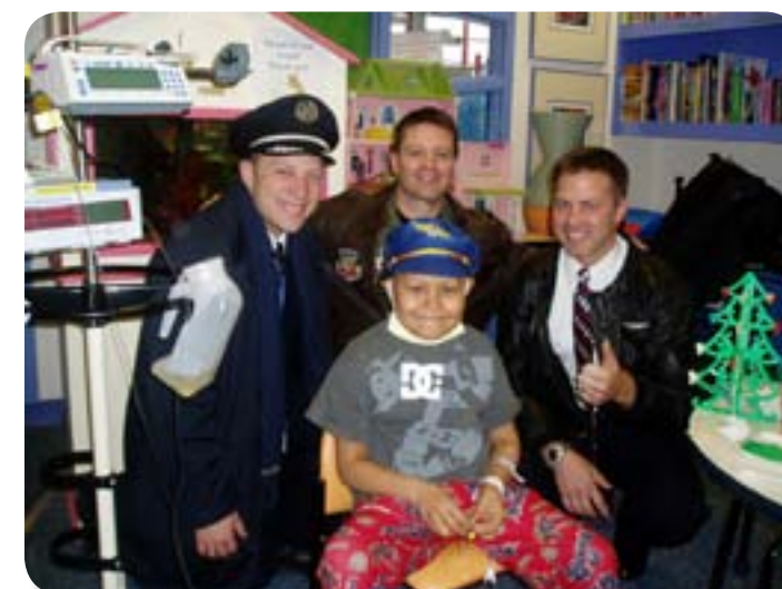
Above and below, PFK volunteers in Indianapolis visit with young patients at St. Vincent's Peyton Manning Children's Hospital. Looks like these youngsters loved their special aviation-themed hat and slippers!

This is an amazing group of volunteers who generously give money, time and enthusiasm, brightening the lives of hundreds of hospitalized and disadvantaged children year after year.