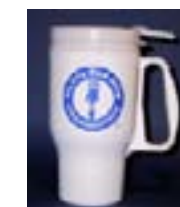
Travel Mugs $9.00