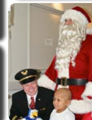
Above and left, Continental crews and their families visited Texas Children's Hospital in HOU on December 7th, spreading plenty of gifts and holiday cheer.