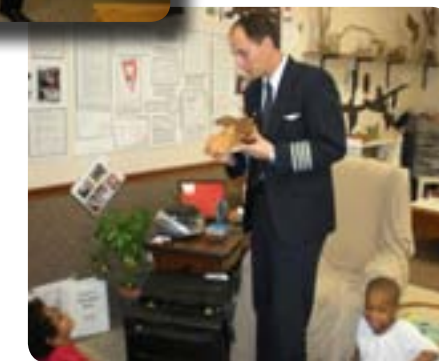
Youngsters at the St. Mary's Child Center in IND enjoy learning about flying from the "pros".