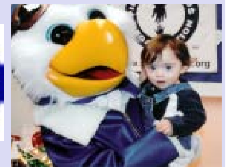
PFK Mascot, Capt. Baldy SM

The Pilots For Kids logo is a registered trademark. The name “Pilots For Kids” and the Pilots For Kids mascot character are protected trademarks and/or servicemarks (SM) of the Pilots For Kids, Inc.