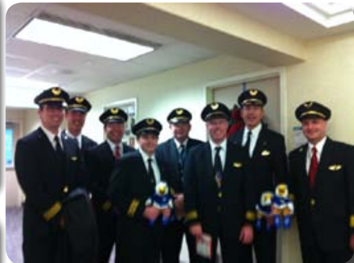
Above and below, Cleveland PFK volunteers visited with youngsters at MetroHealth Hospital and the Cleveland Clinic, sharing gifts and holiday cheer.