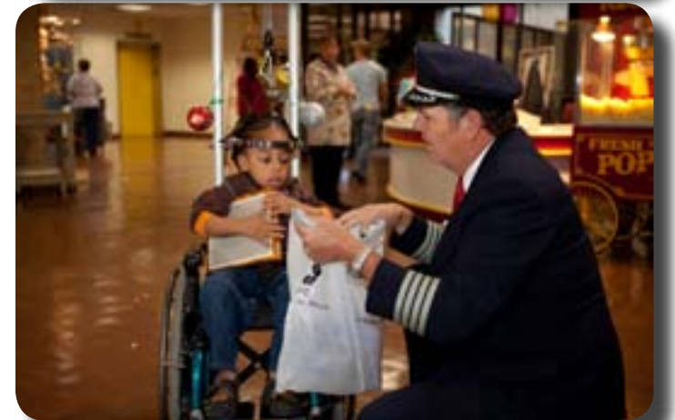
Above and below, PFK volunteers in DFW visited over 600 children at four hospitals in the Dallas/Fort Worth area.