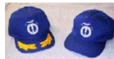
Ball caps $7.50, & $10.00