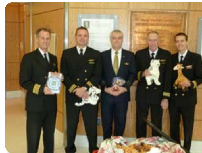
ATL PFK members are shown during one of four visits to Hughes Spalding Children's Hospital in downtown Atlanta. Volunteers visited with over 300 children this year.