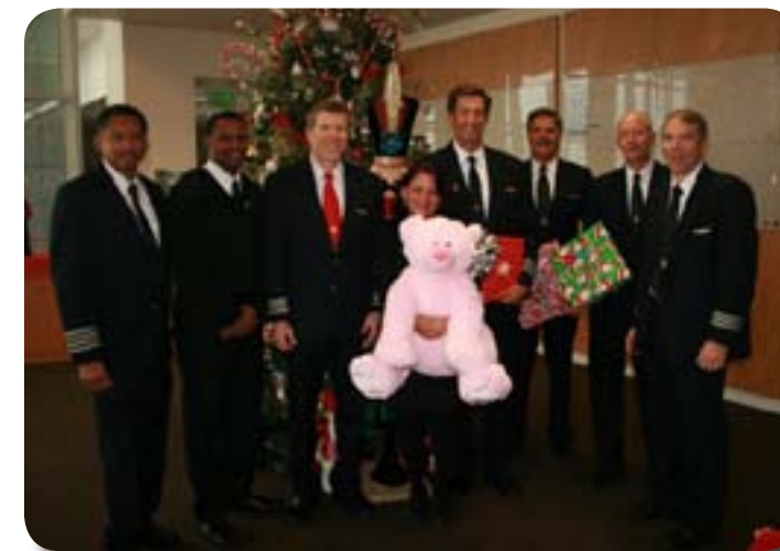
PFK volunteers prepare to deliver gifts to children at the City of Hope Hospital in Duarte, California on December 15, 2010 as part of their holiday tradition.