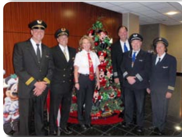
Above, Orlando PFK volunteers enjoyed visits to two local hospitals as well as The Russe Home, a facility for atypical youngsters.