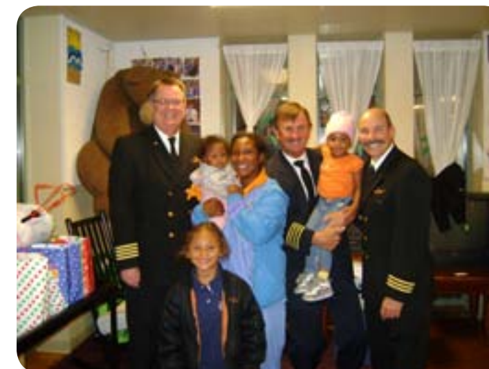
Above, Las Vegas volunteers visited the Women's Shade Tree Shelter during January, 2011, and bringing smiles to all.