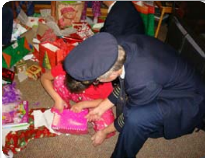
In photos above and left, Denver PFK volunteers visit five shelters in the Denver area bringing gifts and holiday cheer to the residents.