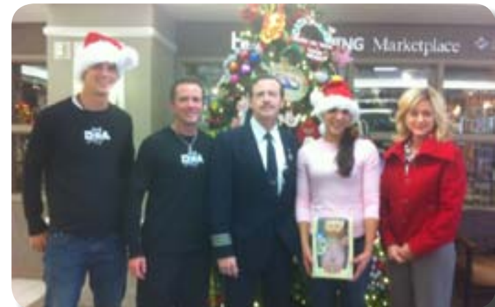
SAT volunteers helped to brighten the holidays for young patients at Christus Santa Rosa Children's Hospital on December 16th.