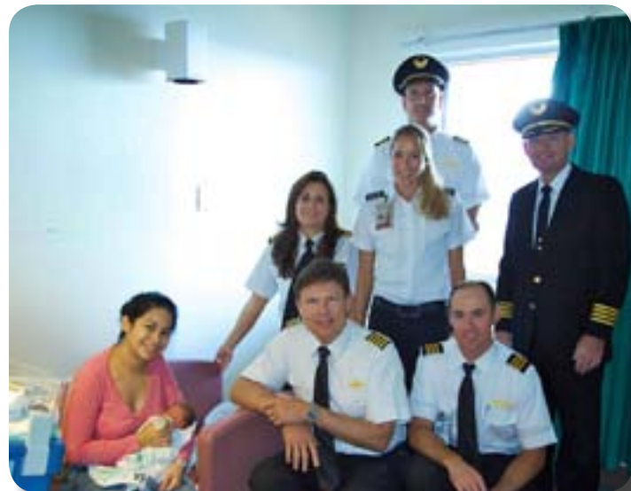
Above and below, PFK volunteers from CAL and Cape Air visit young patients at Guam Memorial Hospital.