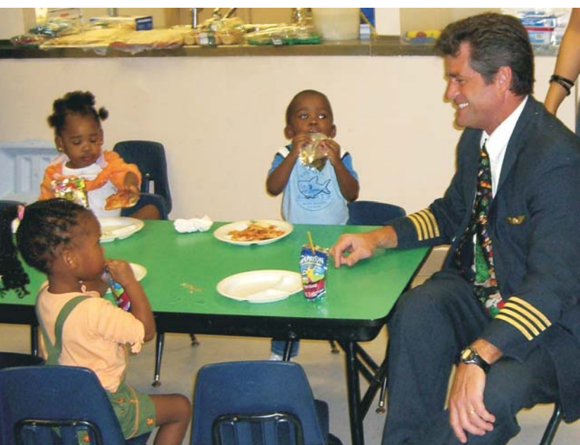
Northwest pilot having some fun with the kids on a visit in JAX.