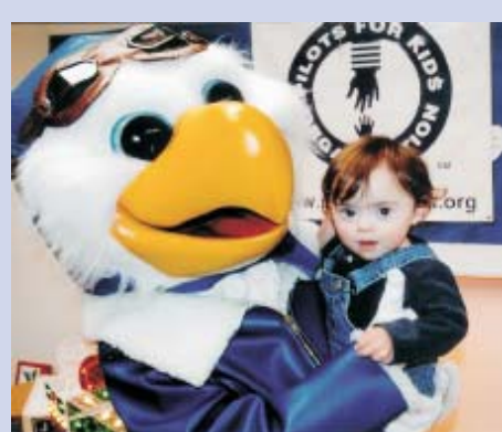
PFK Mascot, Capt.Baldy