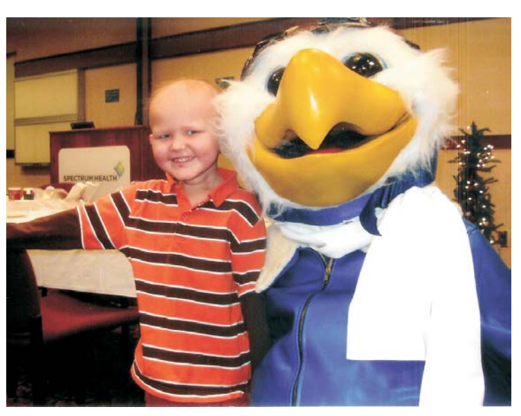
PFK's mascot Captain Baldy with a new friend in GRR.