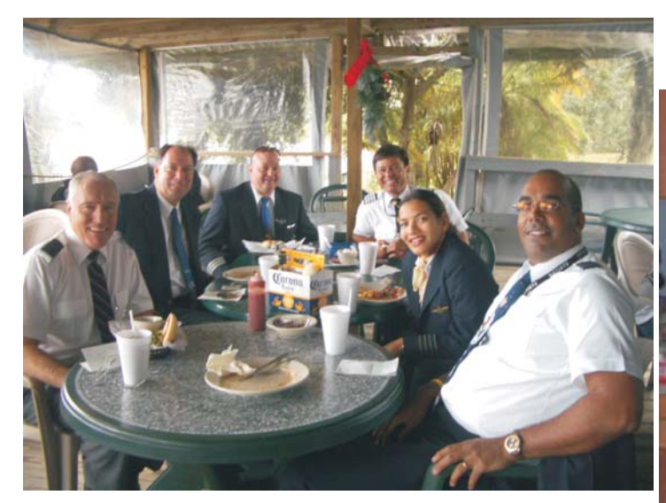
Pilots For Kids members having lunch after visiting two hospitals in the Orlando area.