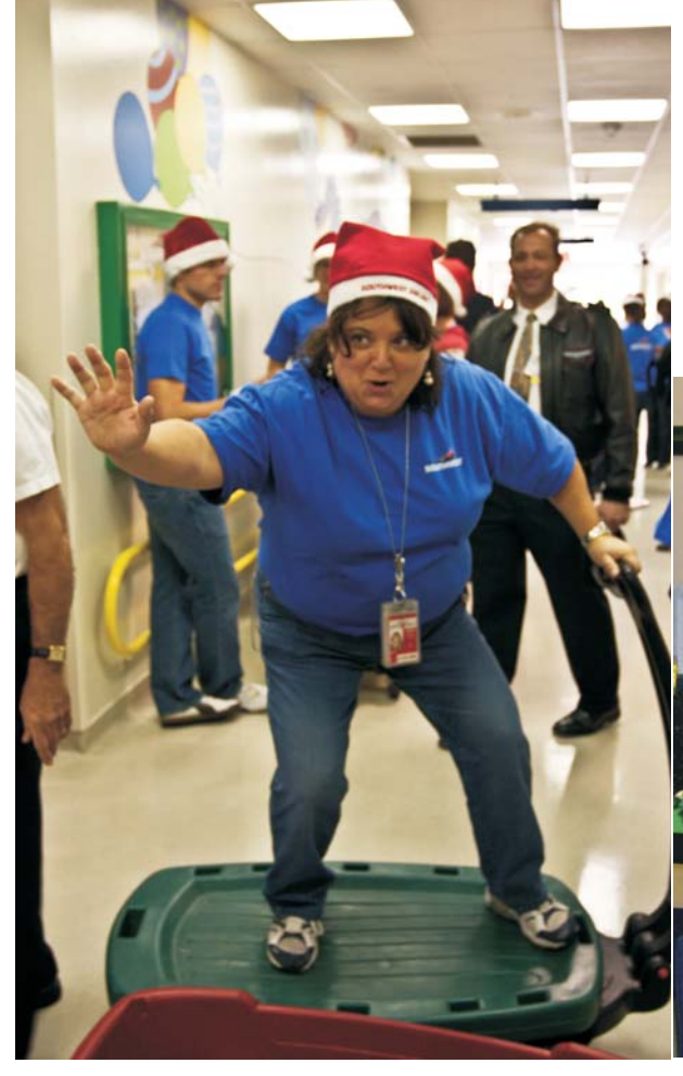
"Surf's up!" Southwest flight attendant shows off her technique on a visit in DFW.