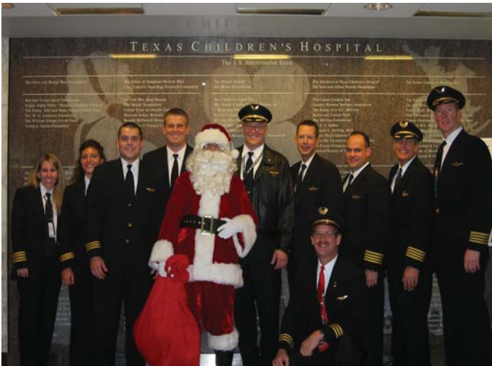
Continental and ExpressJet crew members were joined by Santa in their visit to Texas Children's Hospital in Houston.

Continental and ExpressJet pilots spent time spreading holiday cheer on December 3rd at Texas Children's Hospital in Houston. Santa was able to take time from his busy schedule and help deliver several cart loads of PFK plush bears to the children. A wonderful time was had by all.