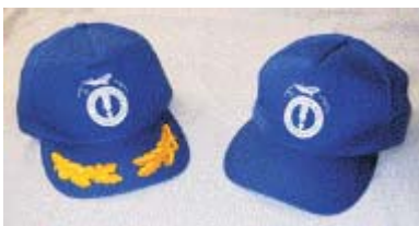
Ball caps $7.50 & $10.00