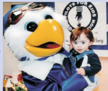
PFK Mascot, Capt. Baldy

The Pilots For Kids logo is a registered trademark. The name "Pilots For Kids" and the Pilots For Kids mascot character are protected trademarks and/or servicemarks (SM) of the Pilots For Kids, Inc.